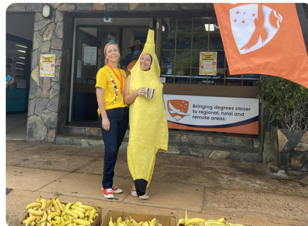
We brought the laughs (and the bananas!) as we hosted the Discovery Festival's Banana Eating Competition