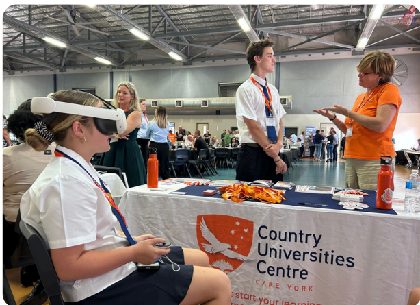
Our team attended the Futures Symposium in Weipa

From careers expos to conferences, we've been out and about connecting with students, community, and education leaders across the Cape and beyond.