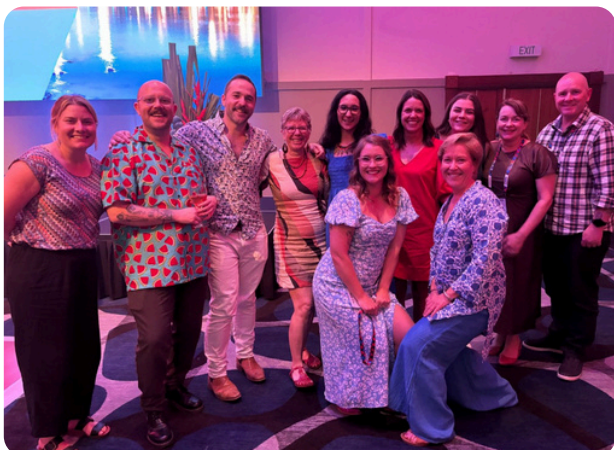
Kerry took part in the STARS Conference in Cairns, bringing back ideas to better support our students