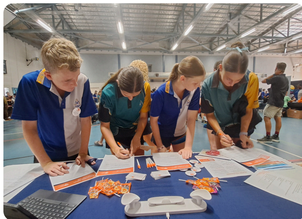
Western Cape College Careers Expo