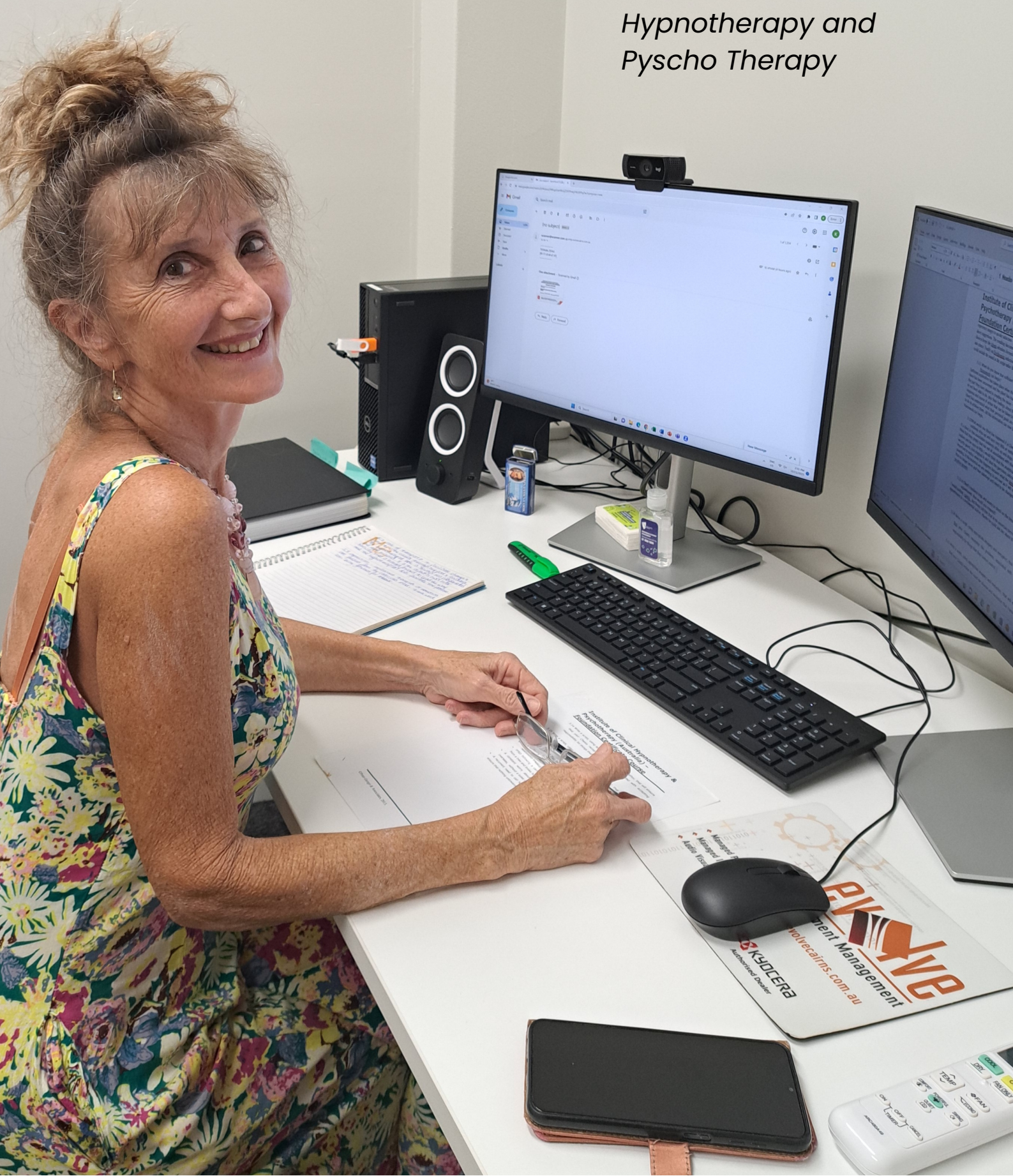
Karen Furst Foundation Certificate in Hypnotherapy Institute of Clinical Hypnotherapy and Psycho Therapy